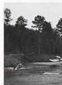
THEN & NOW

Actually, the 12th hole used to have three bridges. At one time Rae's Creek forked, and golfers had to cross the stream twice before reaching the green. The fork was eventually filled. a.x.